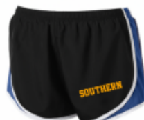
Girls specialty shorts: $15

*If you are unable to attend either of these events, uniforms will be available for purchase during your child's PE class*